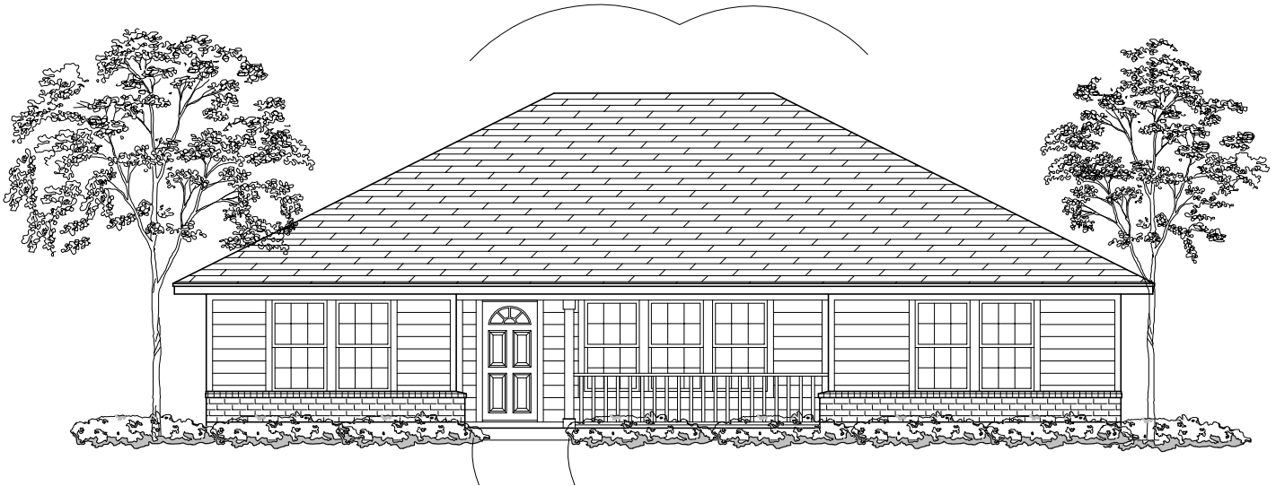
FRONT ELEVATION - PLAN: 1826