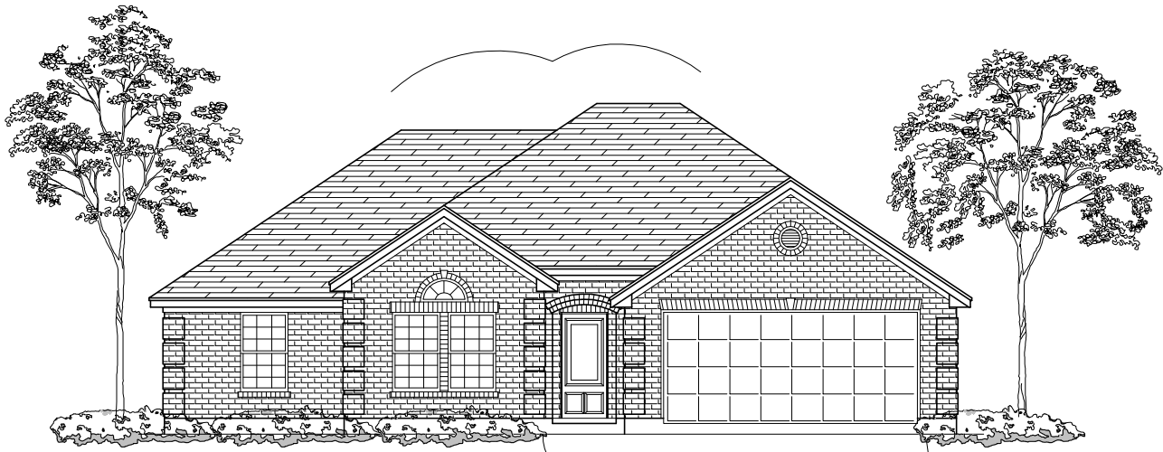
FRONT ELEVATION - PLAN: 1870