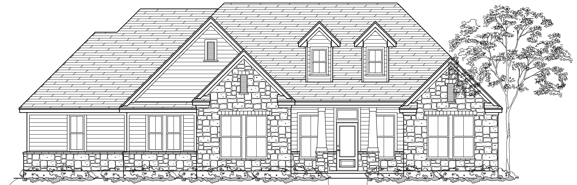
FRONT ELEVATION - PLAN: 1942