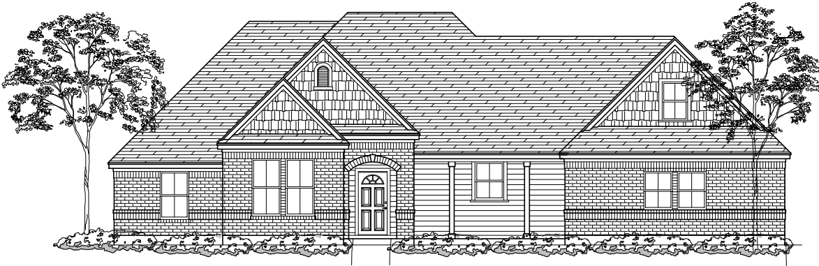
FRONT ELEVATION - PLAN: 2022