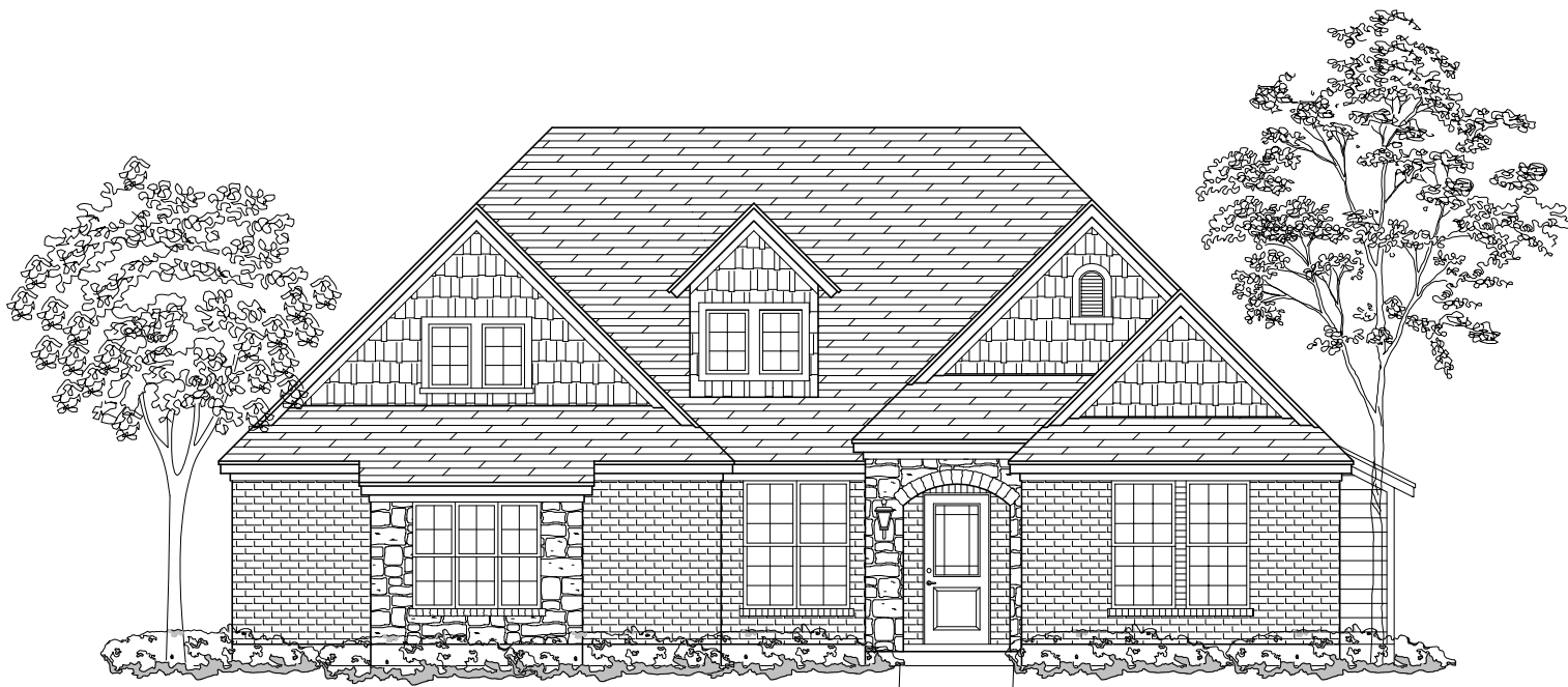
FRONT ELEVATION - PLAN: 2293