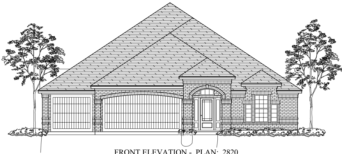
FRONT ELEVATION - PLAN: 2820